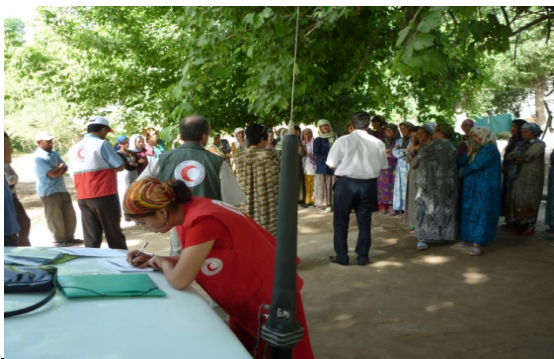
Meeting with population in Zargar jamoat. Red Crescent Society of Tajikistan

In February 2011, the TB project was launched in Bokhtar district with the financial support from the Japanese Government, as similar model in Vahdat and Hissor districts.