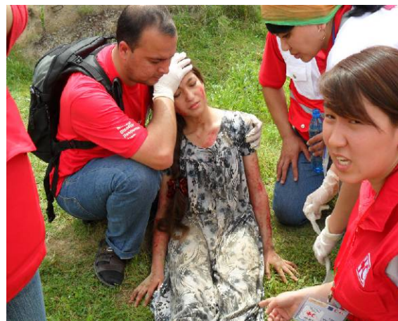
Enhancing first aid skills of RDRT members, RDRT training, Tajikistan, May 2011.

This report covers the period from 1 January 2011 to 30 June 2011.