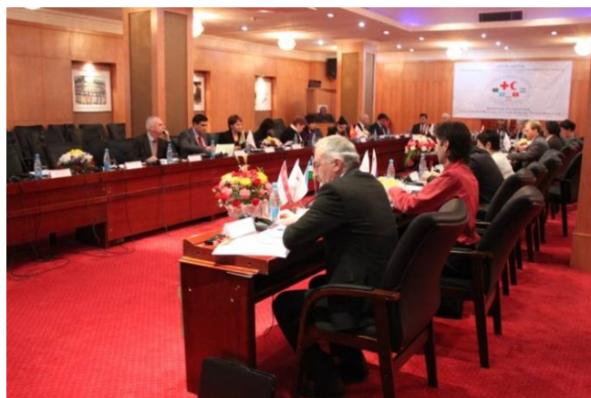
The Tajikistan RC hosted the latest meeting of the Central Asian Red Crescent Societies Leadership Forum on 1-3 March 2011.