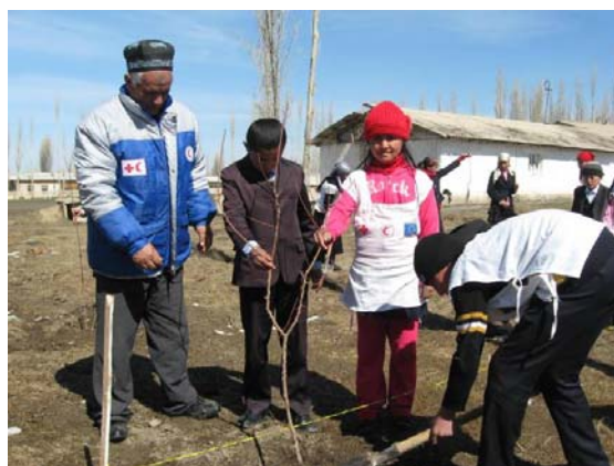
Planting of an orchard on the school premises. RCST Sughd branch

In 2011, Water and Sanitation was the first among other Red Crescent Society of Tajikistan programmes to initiate a close integration with the Disaster Management Climate Change project. This integration aimed to improve the targeted communities' awareness of climate change adaptation and energy efficiency. For these purposes, a workshop was conducted for the remote and mountainous Yangi-Ariki Bolo village (total population is 2,500 people) of Ghonchi district. As a positive result, 30 schoolchildren, 20 teachers and 5 members of water users' committees from one rural community improved their knowledge and skills on climate change adaptation and energy efficiency issues. During the workshop some 200 pieces of information brochures on climate change adaptation and energy efficiency were distributed among the inhabitants and some 150 fruit trees were planted by schoolchildren on the school premises.