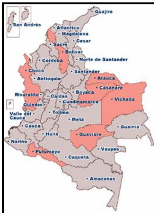
Map showing the areas affected by the latest wave of severe weather

The government, through the National Disaster Preparedness and Response System (SNPAD), authorized the release of money from the National Disaster Fund, to be managed by local committees in the affected departments. In total, COP 1,049,088,365 (490,295 CHF) were distributed, to be used during the period January to May. However, during the latest wave of heavy rain, the government released an additional COP 52,000 to provide humanitarian assistance to the departments of Arauca and Putumayo.