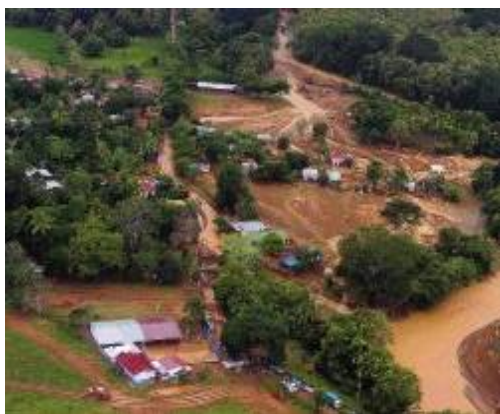
Flooding in Quepos, Puntarenas

A budget has been prepared itemizing the capital equipment and relief items referred to above and costing administrative and personnel expenditures for implementation of the operation to assist those affected by flooding.