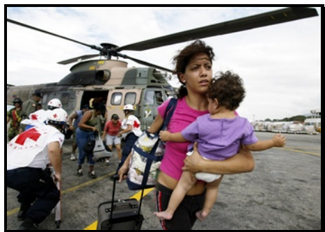
Red Cross volunteers help in rescue and transportation.

As soon as the Venezuelan government declared a state of emergency, the Venezuelan Red Cross (VRC) activated its national and regional emergency plans by mobilizing relief personnel from the branches in the affected States. The VRC is working in coordination with the Civil Protection and the National Fire Brigade in different states and with its volunteers in twelve branches: the nine branches each of the states that have declared an emergency, plus three neighbouring state branches that are supporting the relief activities. There are currently 485 relief volunteers throughout the country, including 90 youth volunteers that are working in the coastal region and another 360 VRC volunteers who are assisting in search and rescue, transportation of evacuees, collection of humanitarian relief goods, assessments of shelter management and provision of first aid services.