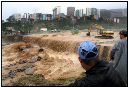
Workers clear a road flooded by a river during torrential rains.

The torrential rains that have been battering Venezuela for the last 10 days have now moved further inland, providing some relief to the northern and central coasts of the country but bringing death and destruction to the Andean region near the Colombian border. The death toll has now grown to 61 according to the latest report from the Venezuelan Red Cross (VRC). More than 175,500 persons (128,000 children) have been affected by the floods and mudslides, 42 have been injured and 43 have been reported missing. Almost 18,000 persons are now staying in temporary shelters. Nine states have declared states of emergency due to this disaster: Aragua, Carabobo, Falcon, Merida, Miranda, Tachira, Vargas, Yaracuy and Capital Federal. The States of Trujillo and Zulia have also been seriously affected by the rains.