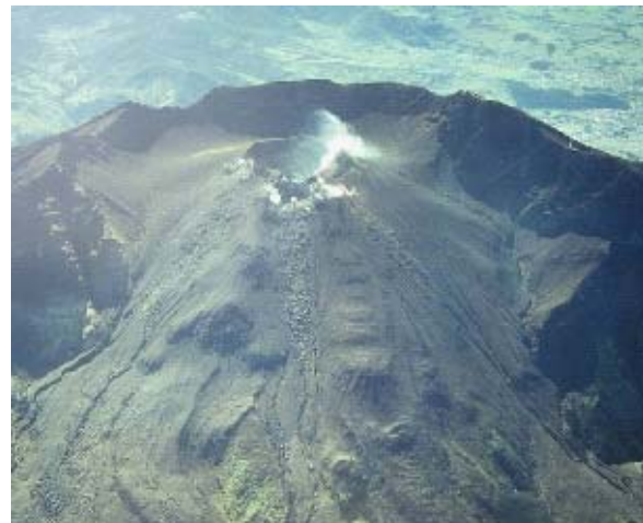
Aerial view of the Galeras Volcano