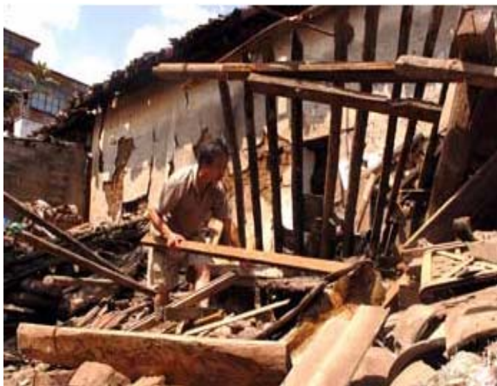
A man picks through the remains of his house after the earthquake.

Ning'er County, covering 3,670 square kilometres, has a population of 190,000. It had reported nine quakes measuring five or above on the Richter scale in history, with the strongest at 6.8 which occurred on 15 March 1979.