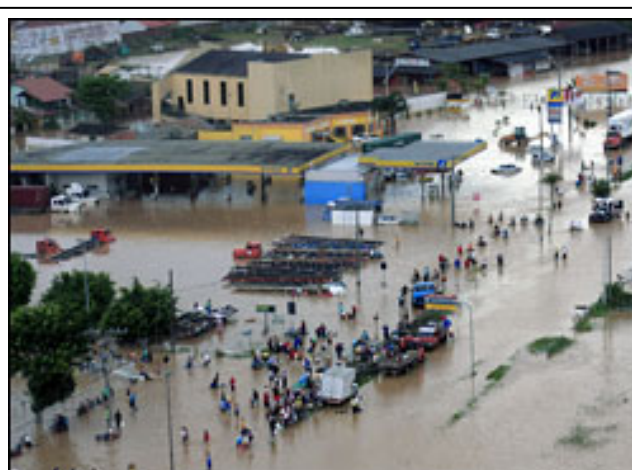
Severe floods affecting the state of Santa Catarina, Brazil.

<Click here for the DREF budget, or here for contact details, or here to view the map of the affected area>