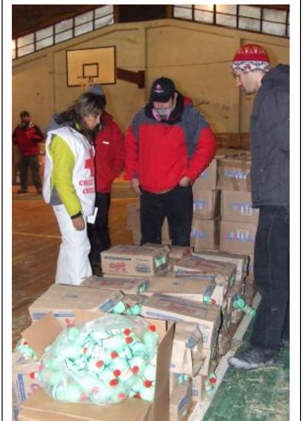
Distribution of hygiene kits.

More than 50 volunteers from the local CRC branches of Puerto Montt, Ancud and Castro assisted the displaced people and provided basic psychosocial support. 8 CRC volunteers distributed 6,000 litres of