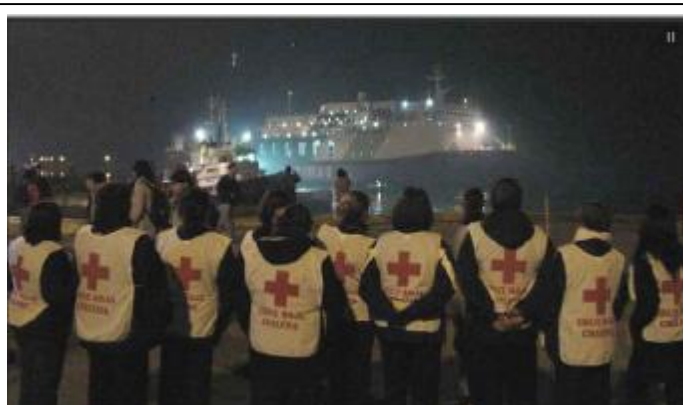
CRC volunteers waiting to receive the displaced families.

On 2 May 2008, the Chaiten Volcano entered an eruptive phase after being inactive for many years. The volcanic activity displaced 8,000 people to the cities of Puerto Montt, Ancud and Castro located in the Lake Region in Chile. A red alert was declared in the communities surrounding the volcano.