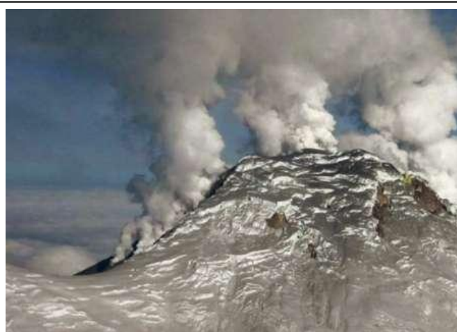
The Nevado del Huila volcano in Colombia.

Summary: The Nevado del Huila volcano in Colombia began an eruptive process on April 14, 2008. There was a red alert I (imminent or ongoing eruption) emitted but was downgraded to orange level (II) (eruption in the next days or weeks due to the decrease in the number of seismological events). This DREF is focused on the purchase of relief items (food and non-food), disaster risk activities vehicle leasing and water and sanitation activities.