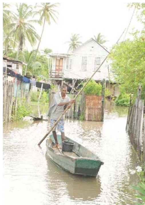
Flooded area in Dochfour.

<Click here for contact details, or here to view the map of the affected area>