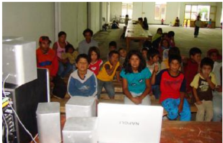
Evacuated children watch movies that have been provided by the Culture Department in a collective centre in the Corrientes province.

A total of 105 people were evacuated in the city of Mercedes due to the overflowing of two creeks, while dozens of people from Chavarria sought shelter. In Curuzu and Caseros, several families sustained damages in their homes, but refused to leave their homes for fear of looting. The fire department along with municipal authorities and the Argentine Red Cross have been assisting the affected people. In addition the municipality in Mercedes mobilized an assistance coordination team to provide humanitarian assistance. The evacuated families are being sheltered in the fire department building. The Municipality and the Health and Social Action Secretariat have been providing food and hygiene items for children and mothers with no social benefits in the municipal collective centre.