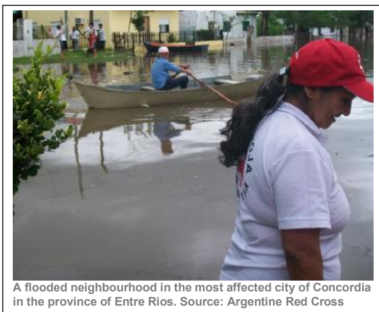
A flooded neighbourhood in the most affected city of Concordia in the province of Entre Rios.

The city of Concordia, located near the border with Uruguay, is one of the most affected due to its proximity to the overflowed Uruguay River. More than 6,000 people were evacuated to collective centres and an undetermined number of people are being hosted by friends or relatives. The Civil Defence in Concordia informed that 20 per cent of the city is under water. Currently, there are 28 open collective centres and most of them are school buildings.