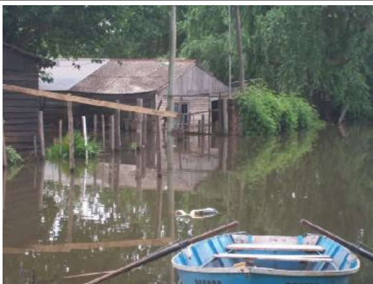
Flooding in the Entre Rios province has damaged houses and property in Concordia in the province of Entre Rios.

<Click here for the DREF budget, here for contact details, or here to view the map of the affected area>