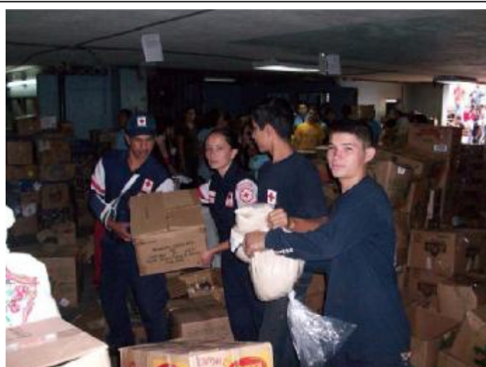
Costa Rican Red Cross volunteers preparing food parcels for the affected people.

This DREF final report highlights the activities accomplished by the CRRC. The DREF funds initially allowed the National Society to perform search, rescue and evacuation activities, and to provide emergency first aid and psychosocial support (PSP) to the most affected. A DREF extension of CHF 65,000 was allocated in order for the CRRC to implement, in coordination with the Pan-American Disaster Response Unit (PADRU), a cash transfer programme for 100 families. Additionally, 500 hygiene and kitchen kits were distributed amongst the most vulnerable in the affected area of Heredia.