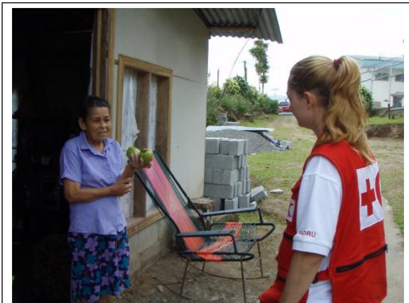
The Regional Intervention Team member talks with a beneficiary during the cash transfer programme carried out in the northern region of Costa Rica.

services were also interrupted. The main damages in this sector were in the communities of Montaña Azul, Vara Blanca, Los Cartagos and Poasito.