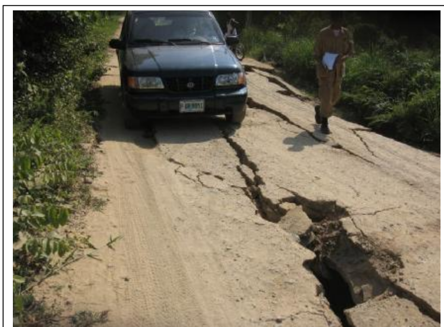
A damaged road in Puerto Cortes.

The Honduran Red Cross has been coordinating the disaster response with local authorities including COPECO and the municipalities of the affected regions. Partner National Societies (PNS) present in the country have contacted the HRC and the International Federation to offer their support.