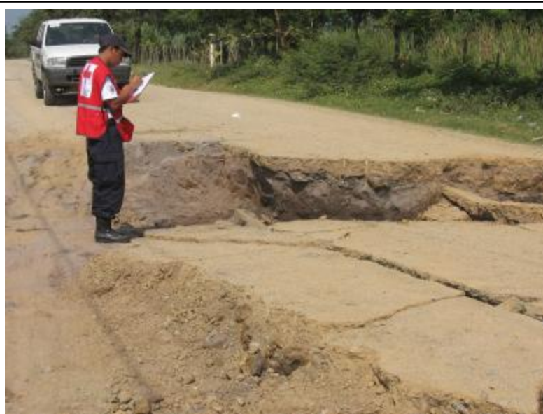
A Honduran Red Cross volunteer carrying out damage assessments on a road in Puerto Cortes.

Summary: A 7.1 magnitude earthquake struck the northern region of Honduras in the early morning of 28 May 2009. Since the onset of the emergency the Honduran Red Cross has been performing damage and needs assessments. This DREF allocation will provide assistance to the Honduran Red Cross in covering operational expenses. In addition, 1,000 people in temporary shelters will receive food kits. Once assessments are completed, the HRC will draw up a plan of action to provide additional assistance, if necessary.