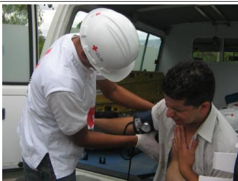
A Honduran Red Cross volunteer assisting a person suffering from high blood pressure in one of the demonstrations.

a Final Report will be made available by 11 March 2010 (three months after the end of the operation). Unearmarked funds to repay DREF are encouraged.