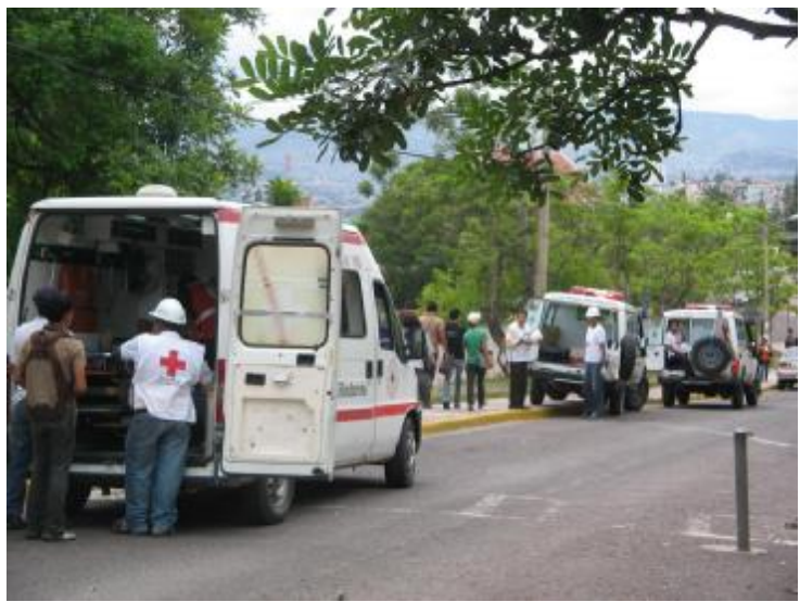
Honduran Red Cross ambulances assisting people in the capital city of Tegucigalpa.

The intensity of the demonstrations has resulted in high peaks of violence on some occasions with short, calm periods. On 29 June 2009 and for several days afterwards, violent confrontations were experienced in the capital city of Tegucigalpa.