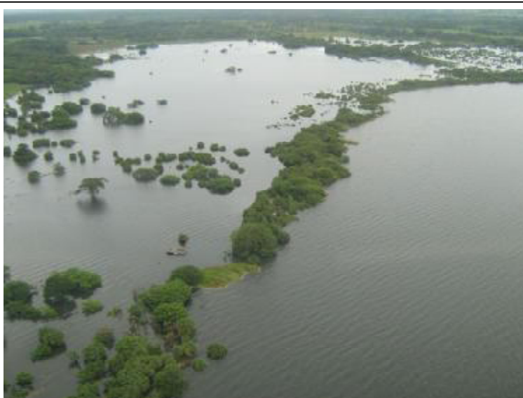
Floods in Huimanguillo, in the state of Tabasco, Mexico.

<Click here for the DREF budget, here for contact details, or here to view the map of the affected area>