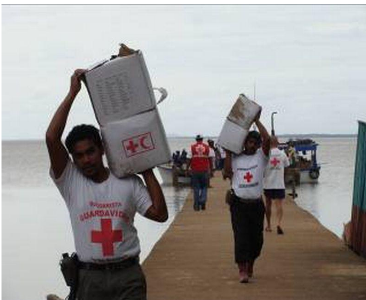
Nicaraguan Red Cross volunteers unloaded relief items in port of the Laguna de Perla municipality.

The Nicaraguan Red Cross's relief operation was carried out by 12 technical personnel and volunteers from the headquarters and the local branch in the capital of Bluefields (Southern Autonomous Atlantic Region). Additionally, a disaster management delegate from the International Federation's Pan American Disaster Response Unit was deployed to Nicaragua during the first days of the emergency to provide support to the National Society.