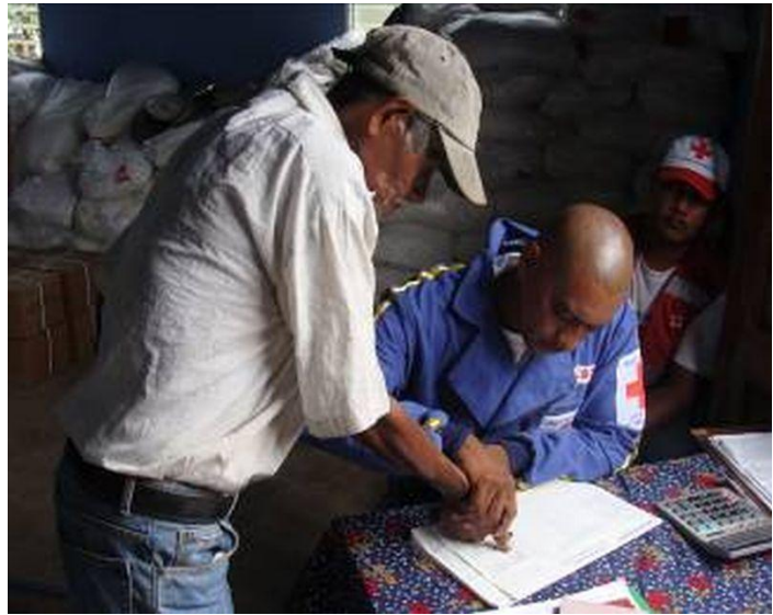
A Nicaraguan Red Cross staff member helps a beneficiary to sign a distribution list using its finger print. Community of Orinoco, Laguna de Perlas municipality, RAAS.

SINAPRED and other local authorities contributed in the rehabilitation of the affected communities by distributing food items, repairing damaged roofs, supporting farmers and fishermen and cleaning contaminated water wells. Moreover, the National government visited several communities including Sandy Bay Sirpe, Karawala and Kara from the municipality of Desembocadura de la Cruz del Río Grande and distributed medical kits and food parcels.