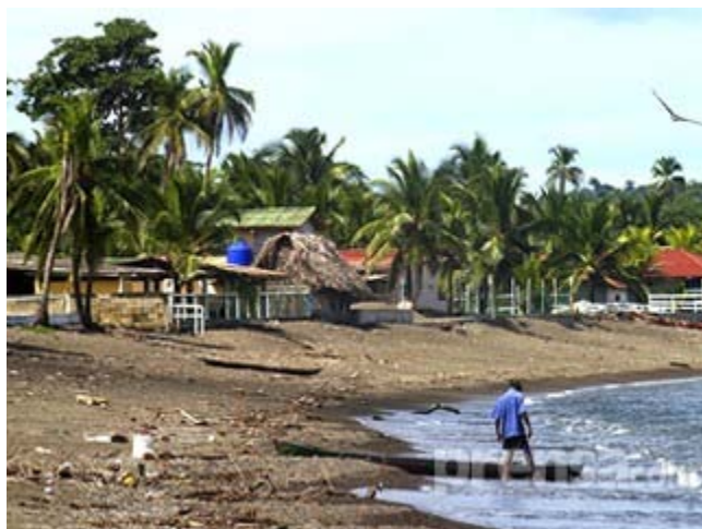
An affected community in Colon

In line with the initial assessments carried out, the National Society has drawn up a plan of action to meet the basic needs of 200 families (with food and non food items) in the province of Darien and 50 families (with non food items) in the province of Colon.