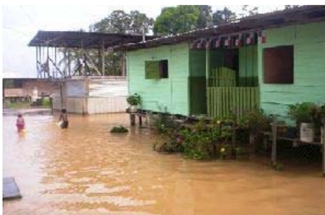
Flooding in the Province of Darien: Source: www.telemetro.com

Summary: Since 19 November 2009, a high pressure system in the low and medium level of the atmosphere in the Gulf of Mexico and the Caribbean Sea has caused heavy rain affecting several regions in Panama with floods. This DREF Bulletin focuses on a summary of the event, and the concrete relief action planned to be taken with the DREF support.