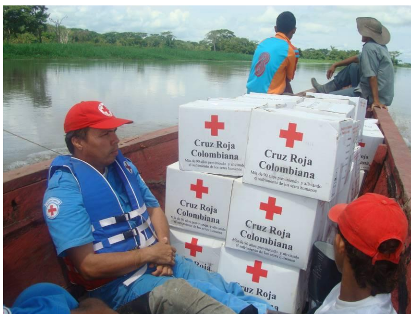
500 families received food parcels and hygiene kits in the departments of Bolívar, Chocó, Magdalena and Sucre.

The weather phenomenon of La Niña has severely affected the rain pattern in Colombia in the year 2010. La Niña brought continuous floods, electric storms, landslides, gales and hail from March to December 2010, without the normal dry months of July and August. In result, the communities and soil did not have the opportunity to recover, and there has been an ongoing need for assistance. As of December 2010 there were some 1,614,676 people affected.