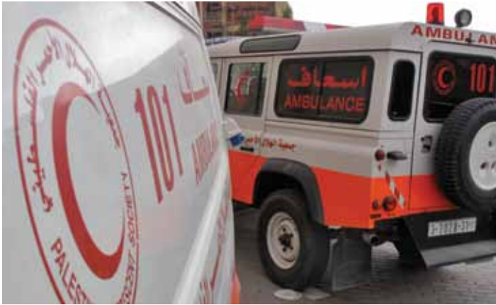
The use of the emblem for protective purposes is a visible manifestation of the protection accorded by the Geneva Conventions to medical personnel, units and transport.