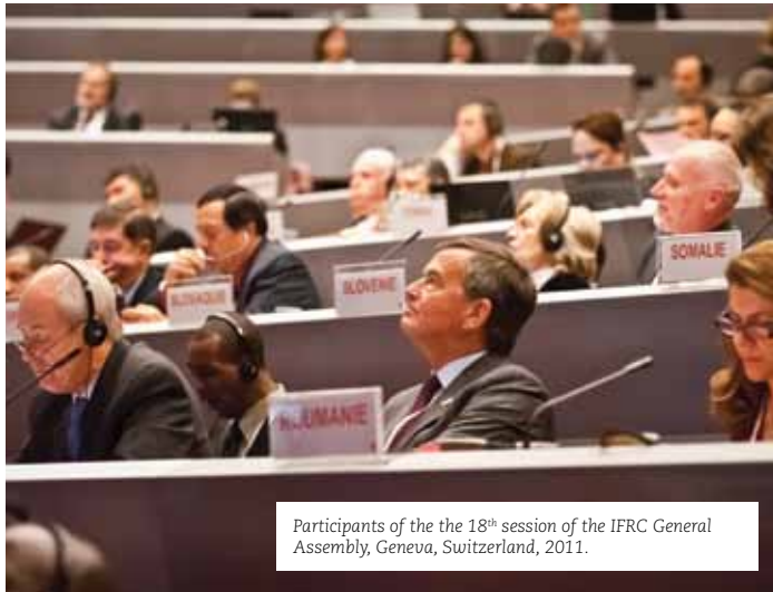
Participants of the 18 th session of the IFRC General Assembly, Geneva, Switzerland, 2011.

National Societies, the ICRC and the Federation are separate bodies. Each has its own individual status and role, and have agreed to mechanisms for ensuring that their actions are well coordinated, and fit a common policy framework where appropriate.