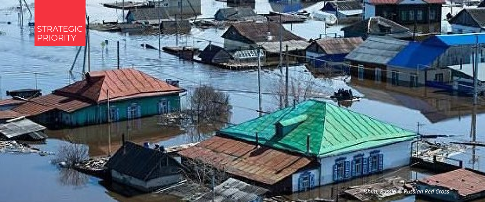
Ishim, Russia