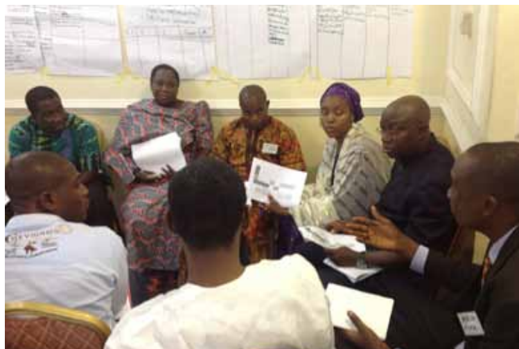
Participants in Nigeria assess their legal framework against the Checklist questions.

As the Checklist itself provides only an introduction to the key issues to consider when reviewing domestic legal frameworks for DRR, a more detailed Handbook on Law and Disaster Risk Reduction (the Handbook) has been prepared to accompany the Checklist. The Handbook provides further guidance on how to answer the Checklist questions by providing a rationale for each question, a list of the types of laws and regulations that would need to be reviewed in order to answer the questions, examples of good practices from different countries, and a set of issues to consider when answering each question. In addition, the Handbook provides information and guidance on how to undertake a legislative review process based on lessons learned from a number of countries.