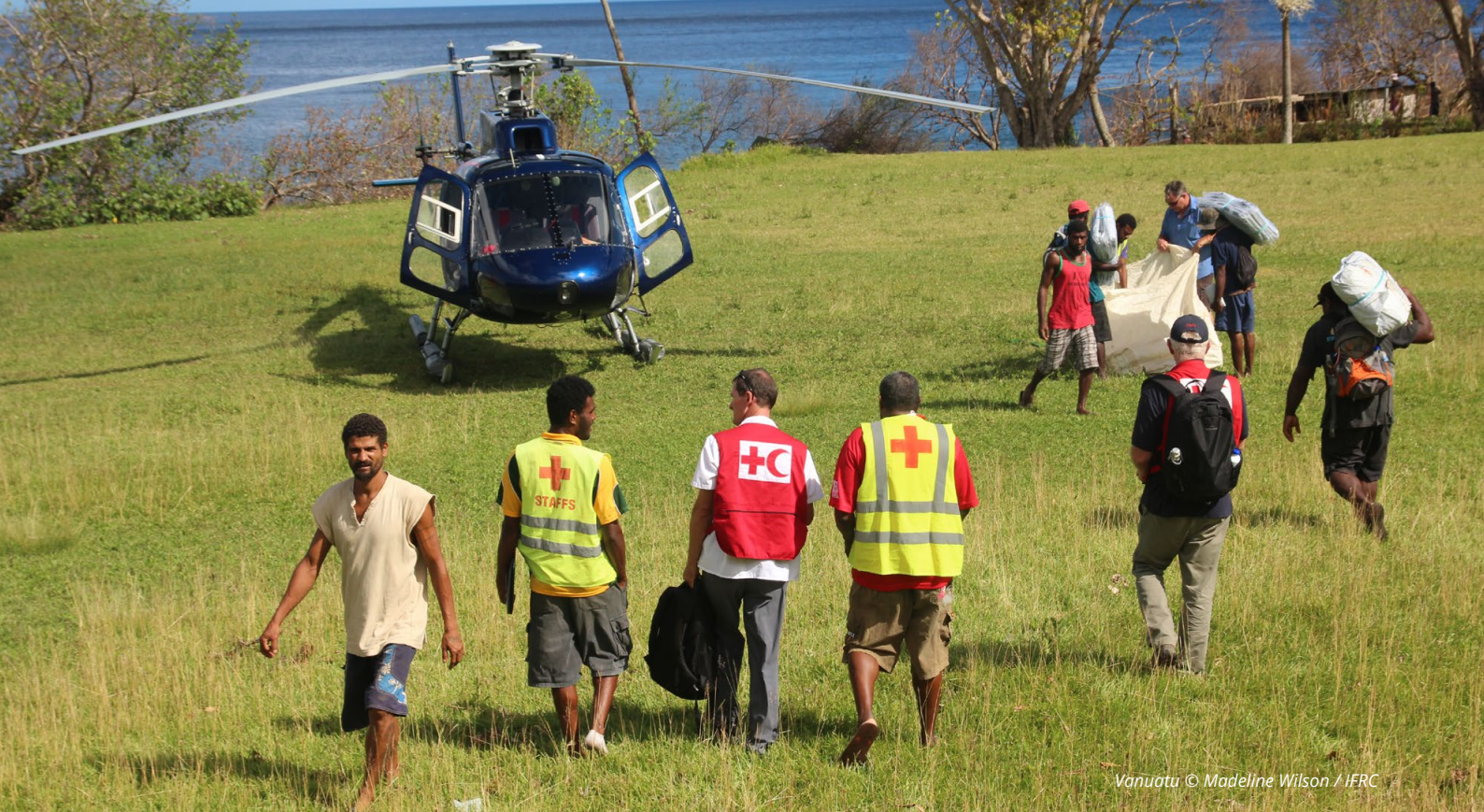
Vanuatu