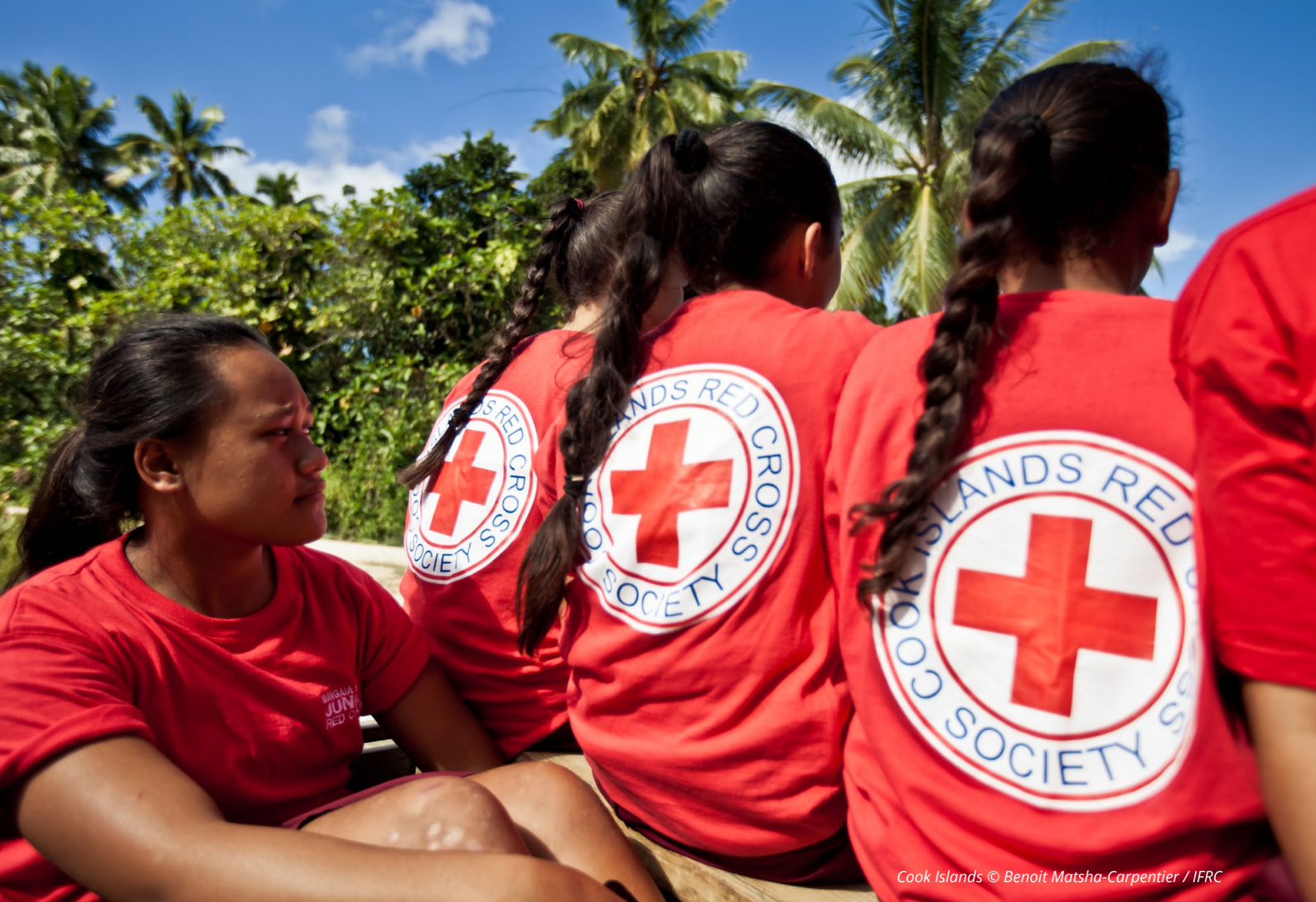
Cook Islands