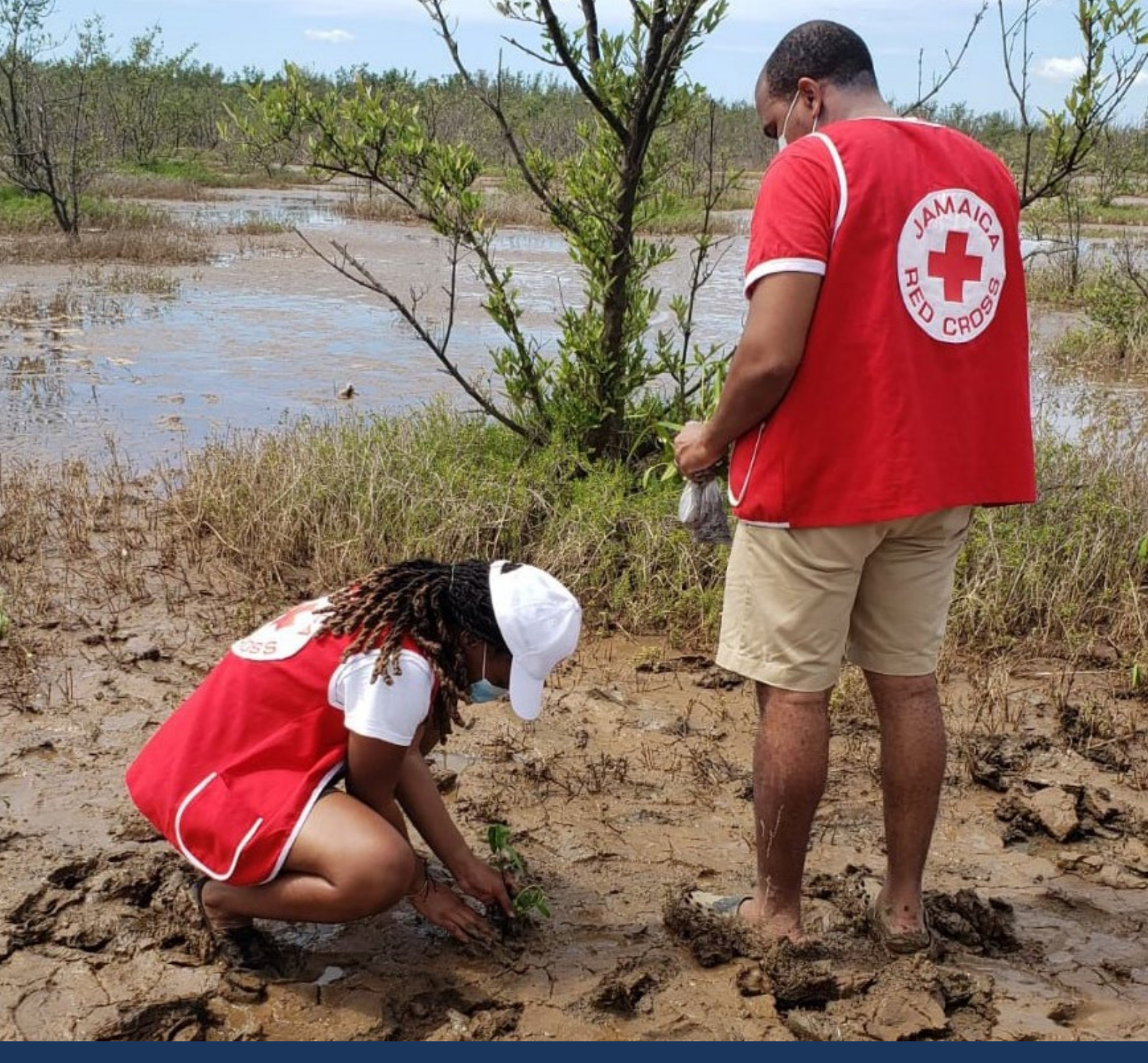
Jamaica 2021 The Resilient Islands project team in Jamaica planted mangroves in Old Harbour Bay as part of its efforts to protect communities against the impacts of climate change by promoting the use of coastal habitats to reduce risks.

The Resilient Islands project has been implemented by National Societies in the Dominican Republic, Grenada and Jamaica, in partnership with the IFRC Secretariat, The Nature Conservancy and German Government, to enhance climate change adaptation through the implementation of nature-based solutions (NbS). The use of rapid ecological assessments alongside IFRC's Enhanced Vulnerability and Capacity Assessment (EVCA) methodology to assess and plan for NbS is now being used as an inspiration by other National Societies for NbS work.