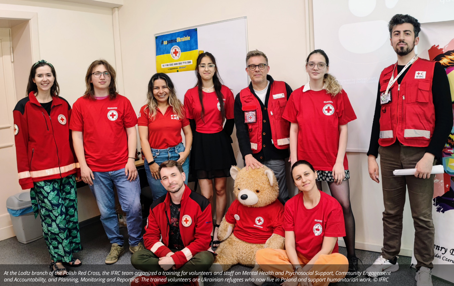
At the Lodz branch of the Polish Red Cross, the IFRC team organized a training for volunteers and staff on Mental Health and Psychosocial Support, Community Engagement and Accountability, and Planning, Monitoring and Reporting. The trained volunteers are Ukrainian refugees who now live in Poland and support humanitarian work.