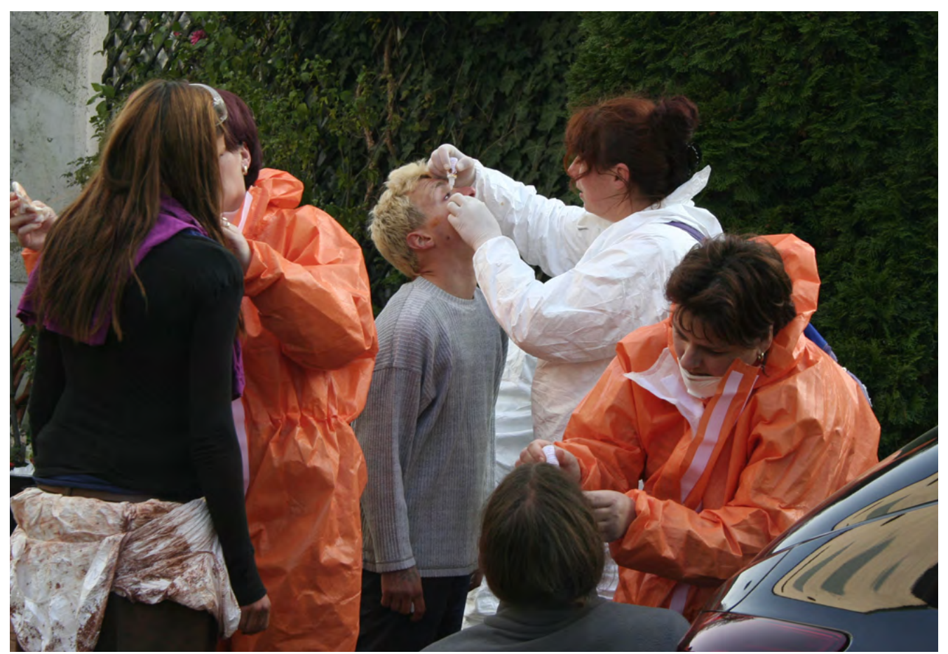
© Red Sludge. Hungarian Red Cross, 2010.