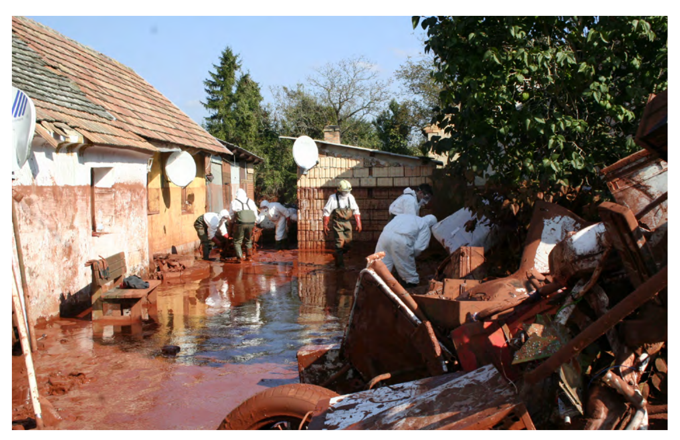
© Cleaning of the debris in areas affected. MTI, 2010.

Recovery activities undertaken by local authorities focused on clearing and cleaning public areas, decontaminating property (forecourts and courtyards, as well as vehicles and machinery), and continuously monitoring water sources, and air quality for dust concentration.