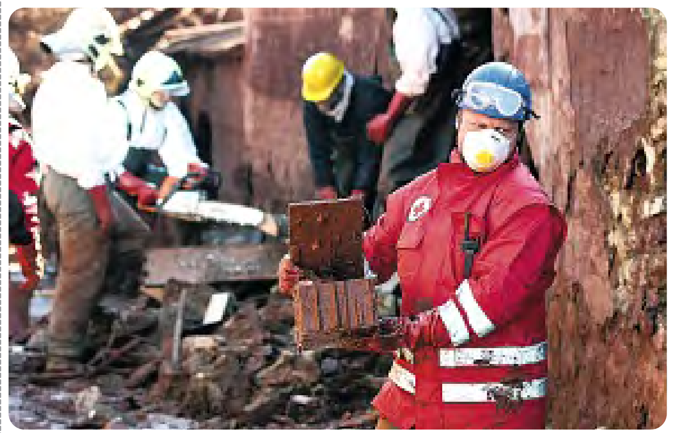
© Red Sludge. Hungarian Red Cross, 2010.

Main HRC activities during the emergency response phase consisted of: