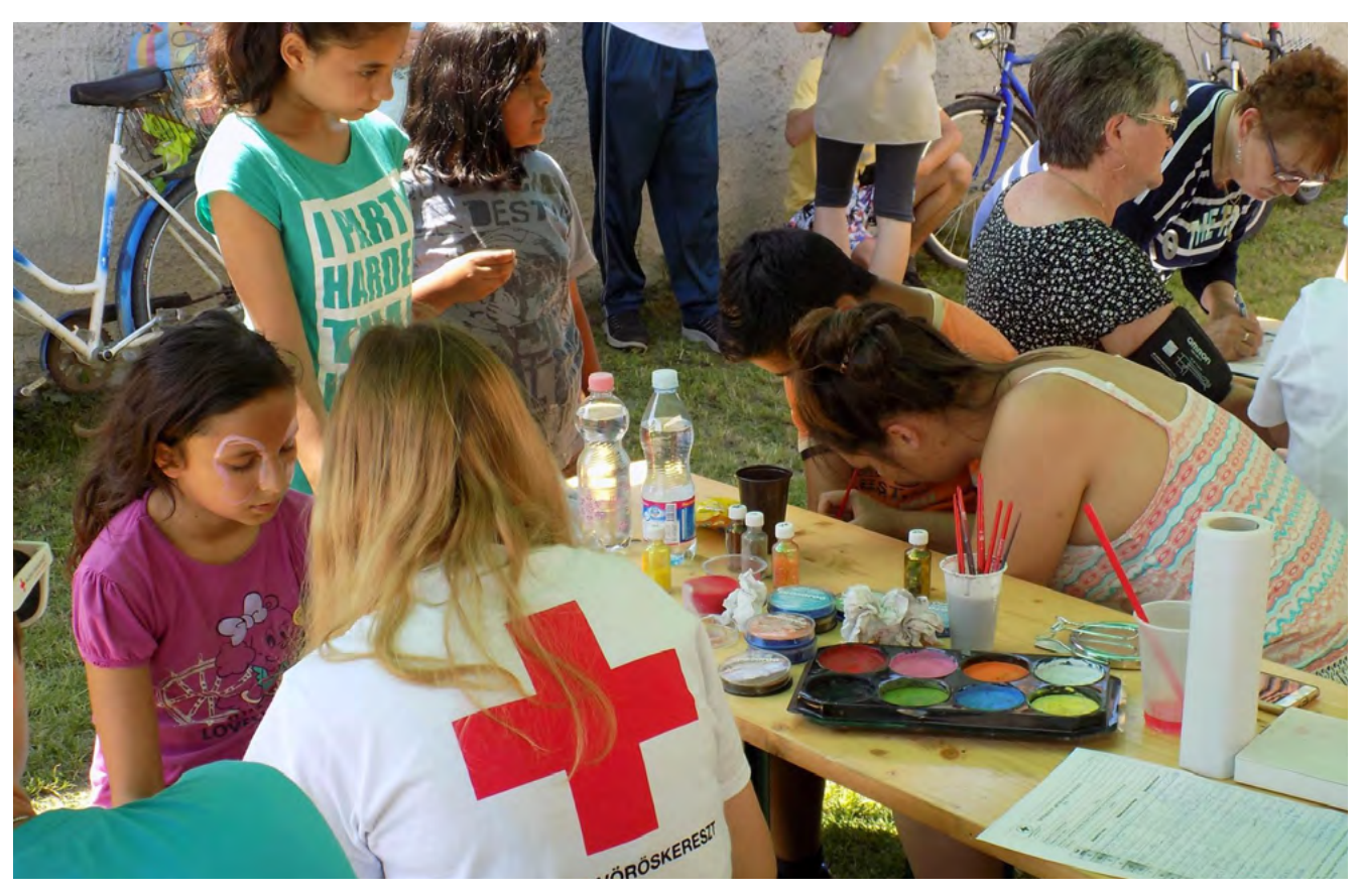
Community-based activities.

As part of the longer-term recovery, HRC initiated a Community Resilience Programme to help the displaced regain their sense of community, and to rebuild ties between the different age groups and socio-economic segments of the population. A wide array of activities was organized by HRC on a regular basis until 2015 – ranging from first-aid training to cooking competitions – and many of these have now been integrated into village life. HRC also established a community centre in Devecser, which continues to thrive ten years later. HRC's initiative is seen as an exemplary resilience-building project and sets the template for future community engagement efforts.