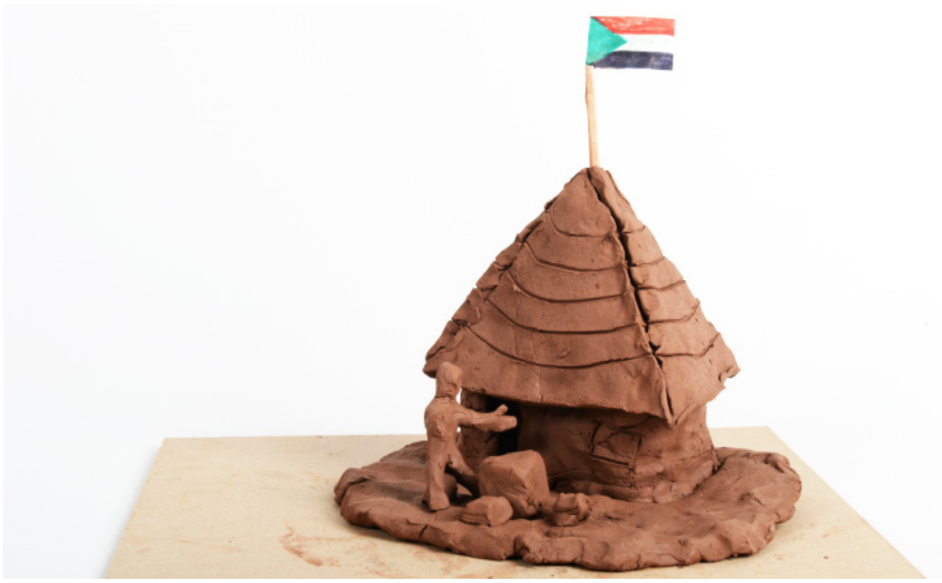
artwork by anonymous young migrant in the United Kingdom.