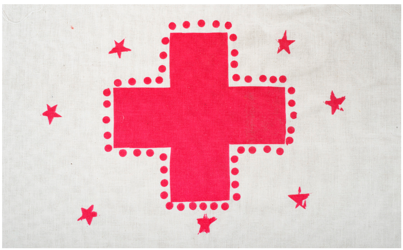
artwork by anonymous young migrant in the United Kingdom.