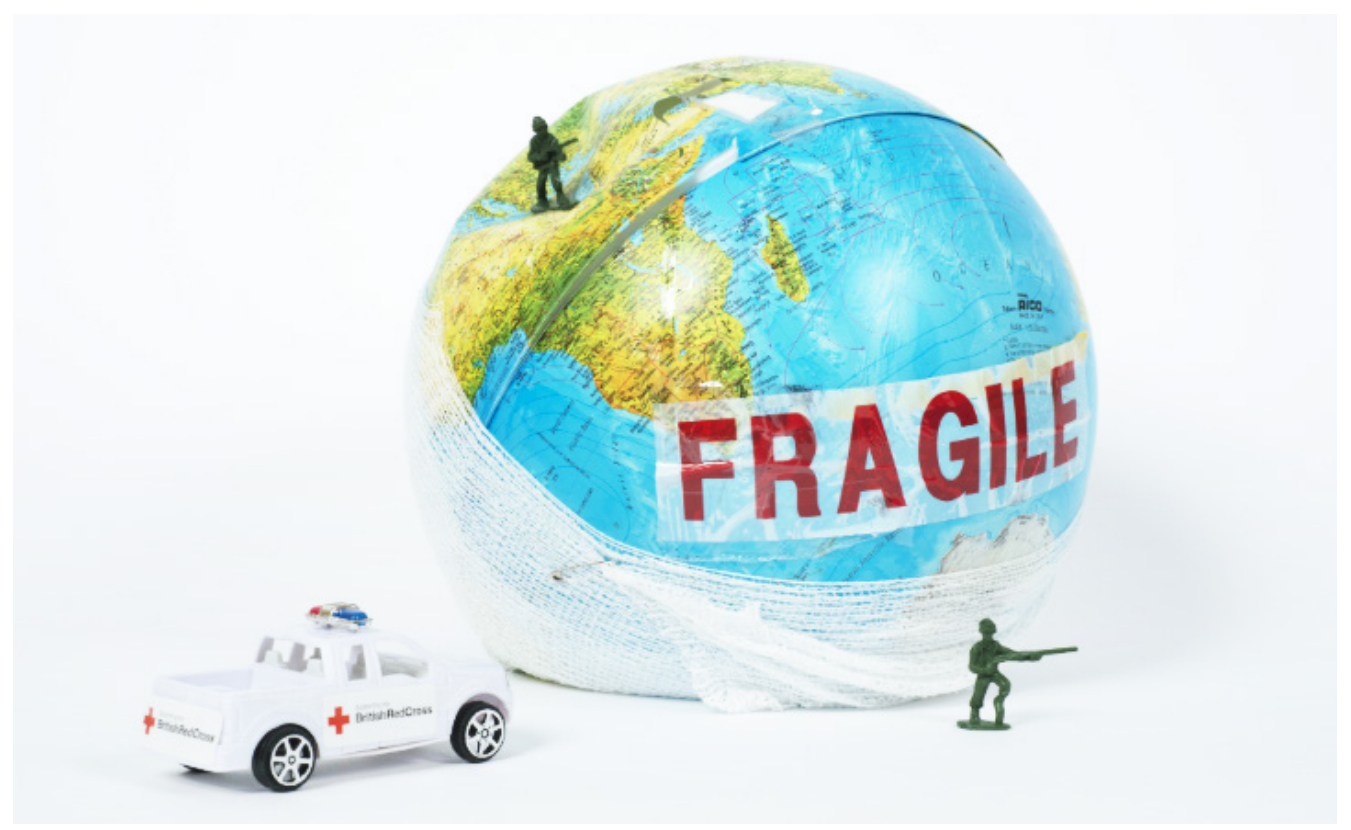
Image: British Red Cross, artwork by anonymous young migrant in the United Kingdom.