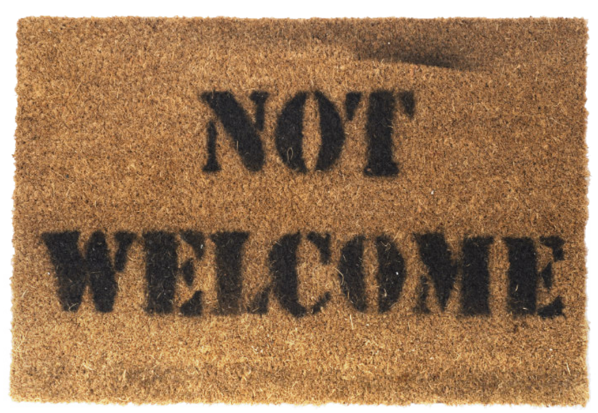
artwork by anonymous young migrant in the United Kingdom.