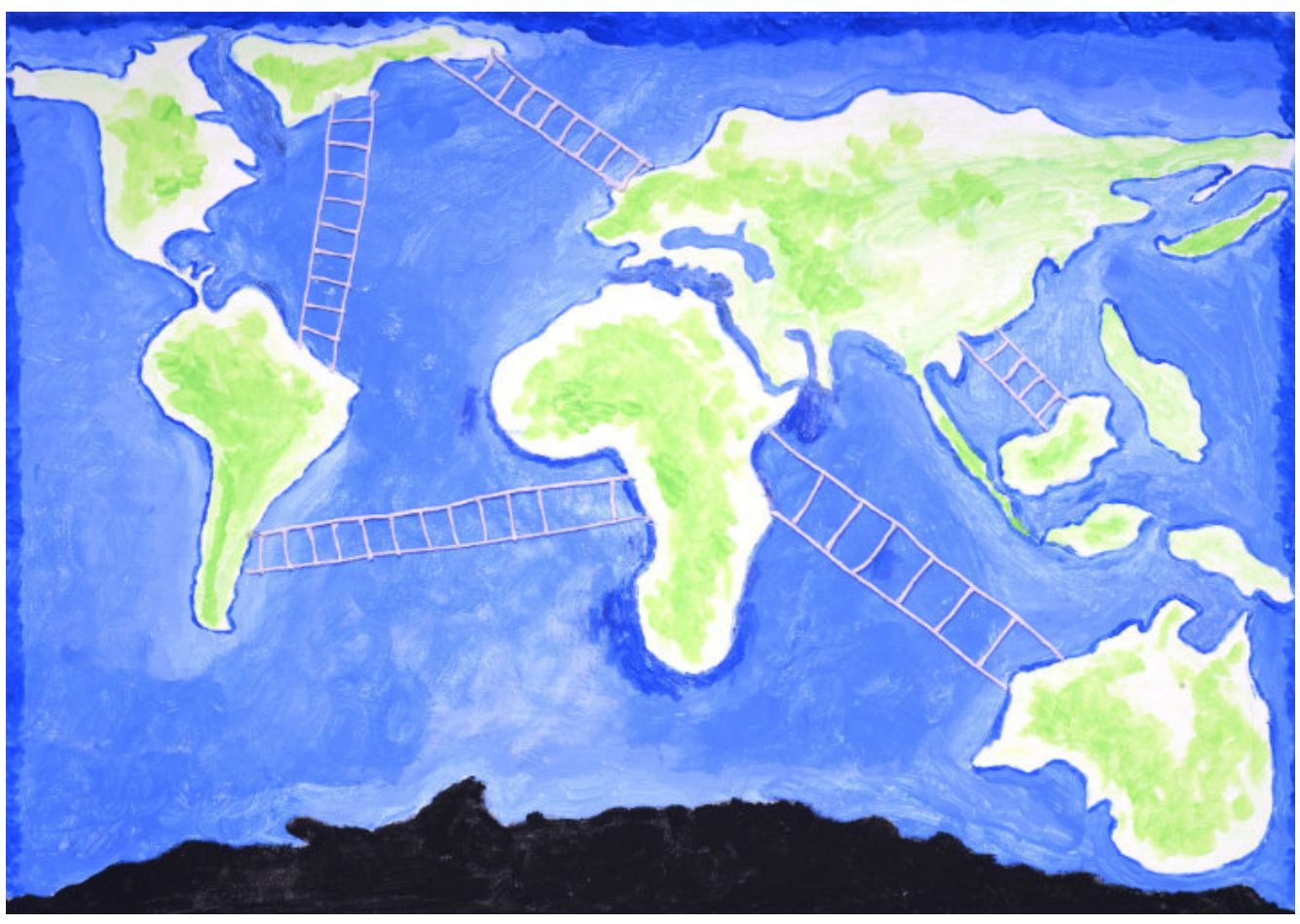
Image: British Red Cross, artwork by anonymous young migrant in the United Kingdom.