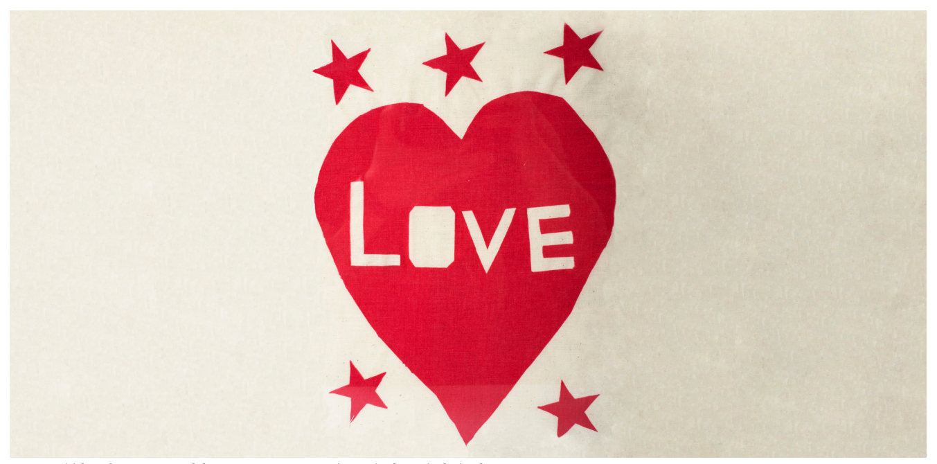
Image: British Red Cross, artwork by anonymous young migrant in the United Kingdom.